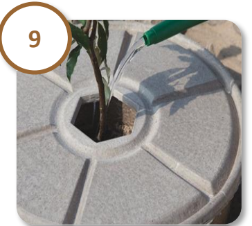
Water the seedling in the centre with about 1 litre of water.