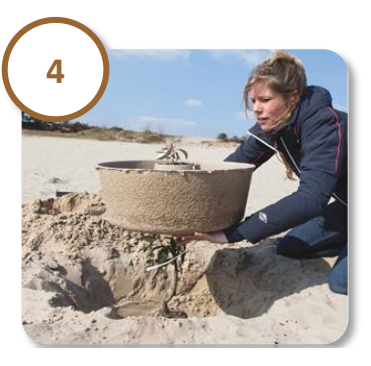
Lower the COCOON over the seedling gently and rest on base.