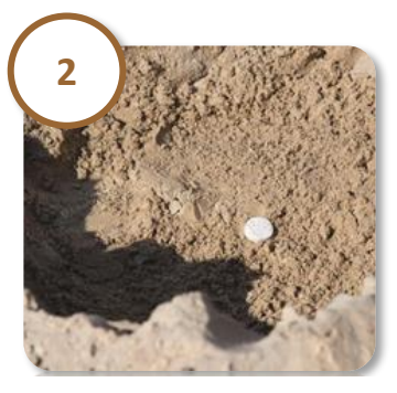
If using slow release fertiliser and/or microbial product, place at centre of planting hole.