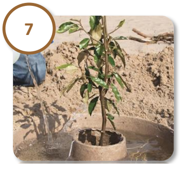
Remove the lid and fill the COCOON to the rim with approximately 25 litres of water.