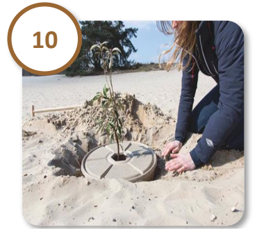
Pack the soil around the the sides of COCOON for a snug fit. Keep soil off lid. Place the tree shelter of the seedling and make sure it is firmly anchored.

CONGRATULATIONS! You have planted a COCOON tree that requires no follow up irrigation!