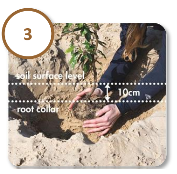
Place the seedling in the centre and pack soil around the seedling roots to create a solid mound.